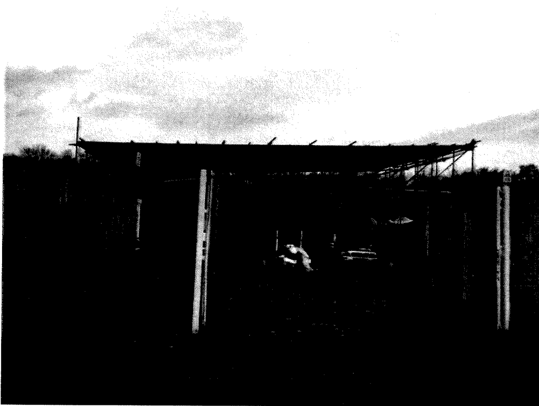
Looking east towards access with D compounds on left