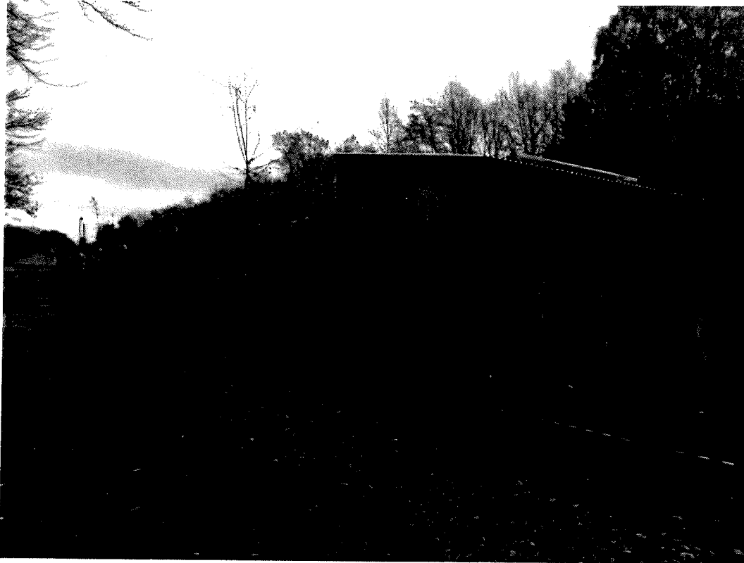
Area where new access is proposed, looking east towards Deepcut Bridge Road